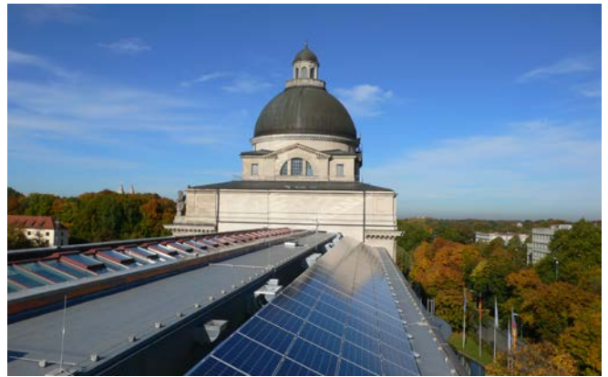
PC05 Trina Solar modules.

Tradition and modernity go hand in hand in Bavaria – and that also goes for the energy system and supply in this economically-strong Southeastern German state. The Bavarian State Chancellery, official residence of Horst Seehofer, Prime Minister of the State of Bavaria, is supplied with solar energy from a PV array. Covering a roof area of 800 square metres, the array generates 70 MWh of solar electricity, which is used by the State Chancellery directly. OneSolar International, a project developer for PV systems and wholesaler for solar products, installed the PV system on the heritage-protected building, using, 296 TSM-