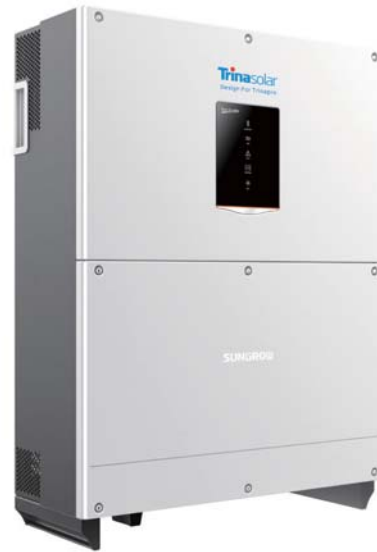
SUNGROW Inverter, Designed For TrinaPro