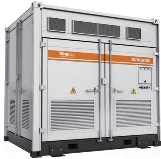
SUNGROW Inverter, Designed For TrinaPro

Turnkey Station for North America 1500 Vdc System